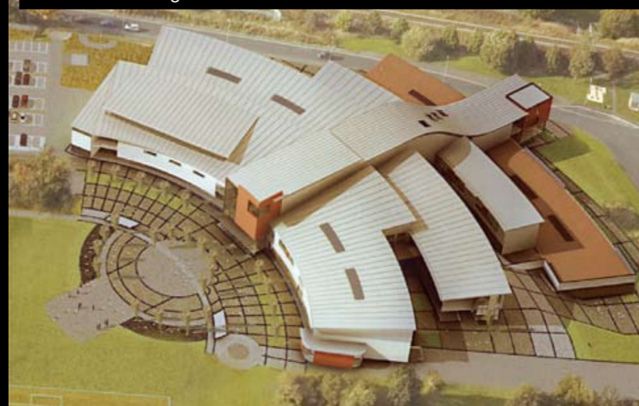
Pendle Vale College

Now reaching the final stages of construction, Walsh-IBS are receiving praise for the high standard of installation, our pro-active approach to working methods and our positive ongoing partnership with Bovis Lend-Lease culminating in our company recently being awarded 'Contractor of the Month'.